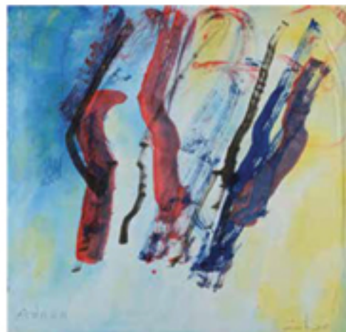
Etel Adnan, Fenîts (detail), Watercolor and China ink on paper, leporello, 15 cm x 32 cm x 64 cm, c.2000-2005.

This January, Lebanese gallery Alice Mogabgab inaugurated its new Brussels space with a solo show featuring the works of writer and artist Etel Adnan. Widely known for her poetry, novels and plays, Adnan moves fluidly between the disciplines of writing and art and is a leading voice of contemporary Arab-American culture. Titled Etel Adnan: encres, dessins, leporello , the show presented two sets of work from private collections in Lebanon. The first set, composed of 13 ink and pencil drawings, was dedicated to the tree, the trunk and even a small piece of wood and their symbolic capacity to represent life. The second set, entitled Forests , comprised of 13 diptychs painted with watercolour and ink, celebrating the world in an explosion of colour.